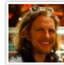
Matt Mullenweg Cofounder, Project Lead